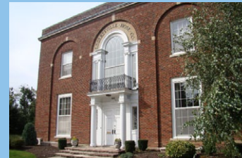
Museum of disABILITY History and Training Center for Human Service Excellence