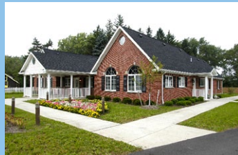
The Downing Family Respite House on Genesee Street