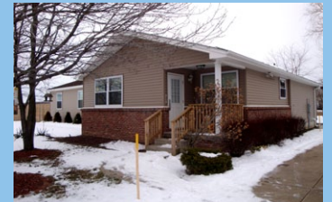
Stonypoint group home in Grand Island