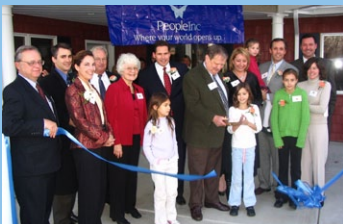
The Vanner House on Sheridan Drive