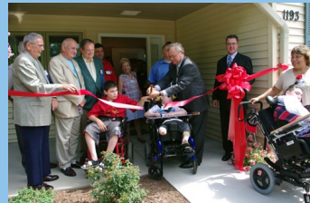
The Jeremy Project for medically-frail children in Tonawanda